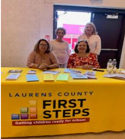
The Laurens County First Steps Staff participating in a job fair event.

FY21 like FY20 was a very interesting year of virtual meetings and attempting to keep up with the latest COVID protocols and learning more about vaccinations.